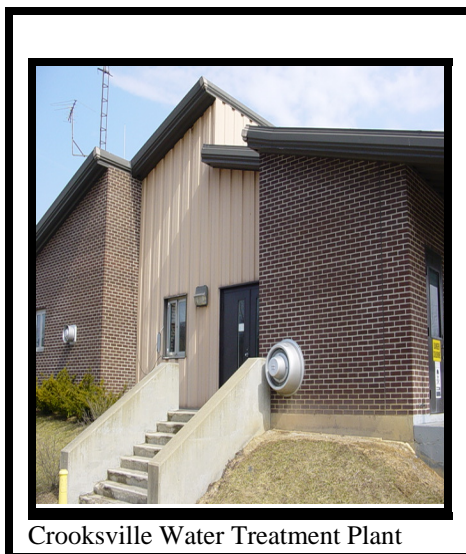
Crooksville Water Treatment Plant

The sources of drinking water both tap water and bottled water includes rivers, lakes, streams, ponds, reservoirs, springs, and wells. As water travels over the surface of the land or through the ground, it dissolves naturally occurring minerals and, in some cases, radioactive material, and can pick up substances resulting from the presence of animals or from human activity.