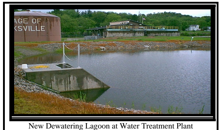
New Dewatering Lagoon at Water Treatment Plant

How do I participate in decisions concerning my drinking water? Protecting our drinking water source from contamination is the responsibility of all area residents. Please dispose of hazardous chemicals in the proper manner and report polluters to the appropriate authorities. Only by working together can we insure an adequate safe supply of water for future generations.